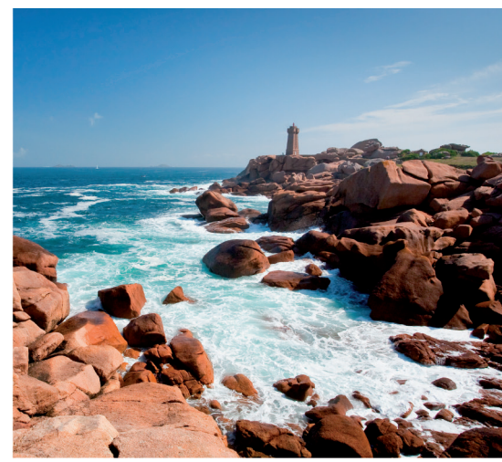
Pink Granite Coast - Brittany