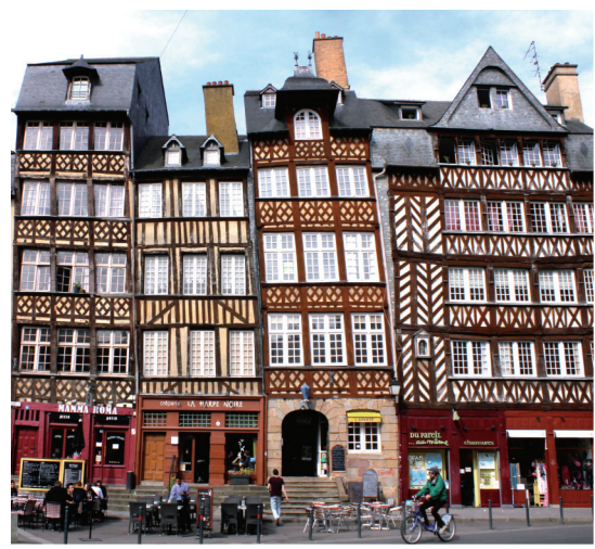
Place du Champ-Jacquet - Rennes

ENSAI is located on the Ker Lann Campus, near the cosmopolitan city of Rennes, France. A 2-hour train ride from Paris, Rennes is known for its numerous cultural events and festivals, as well as being a lively college city with two major universities plus a number of graduate schools. Rennes is the capital of Brittany, a region renowned for some of France’s most spectacular coastline and landscapes.